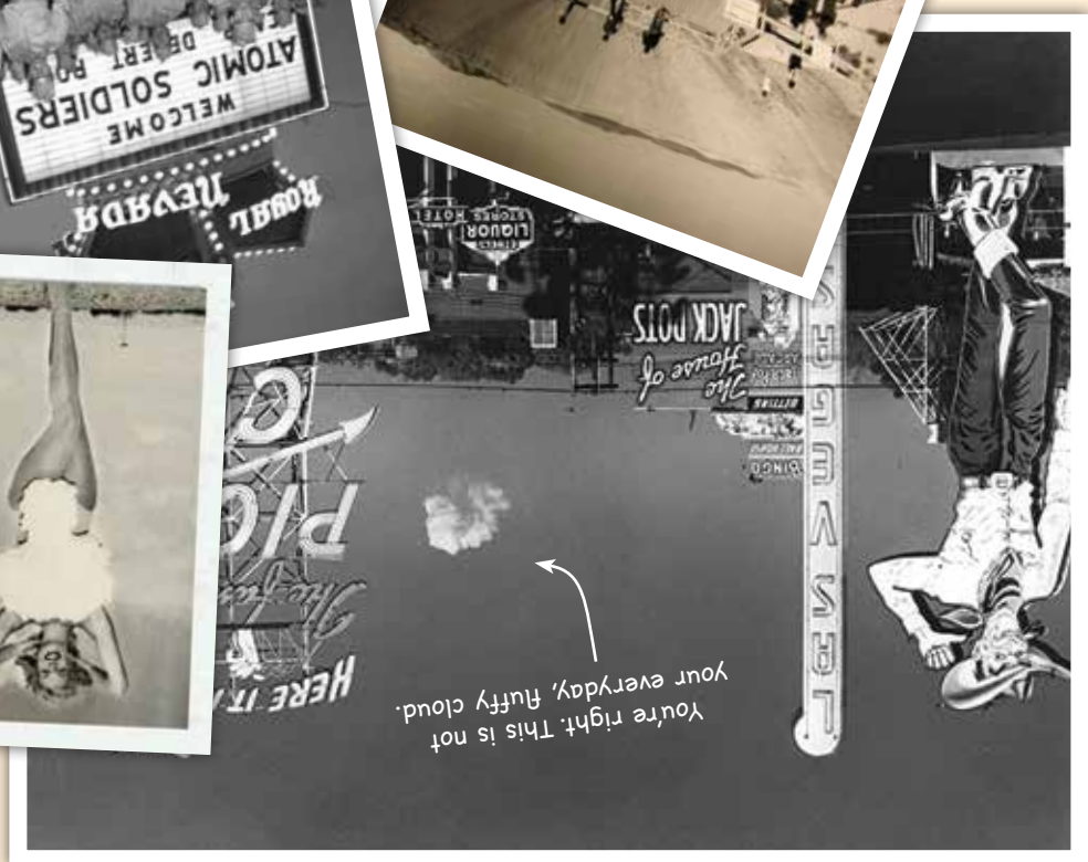
You're right. This is not your everyday, fluffy cloud.